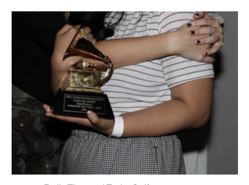
Emily Then and Taylor Swift

blog placed Then into communication with Swift and that eventually this lead to Then spending a day at Taylor Swift's house having friendly conversations. Not between a celebrity and a civilian, but as two people connecting over a shared love for creating and writing