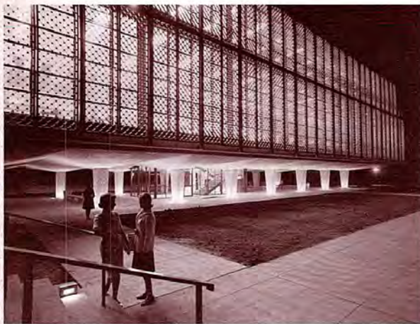
Students converse in one of a series of staged 1964 photographs designed to show off the library's dramatic exterior by night.