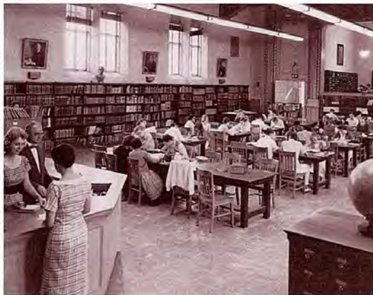
HISTORICAL PHOTOS: WARDMAN LIBRARY COLLECTION

In the years before the Wardmans made their gift, the library occupied a variety of makeshift locations—a remodeled women’s dormitory, the upper floors of Mendenhall, a former art classroom in Founders Hall. For Whittier students, faculty and alumni, a permanent library building was a dream come true.