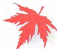
Cover Photo Collage: Lori LeBeau Walsh