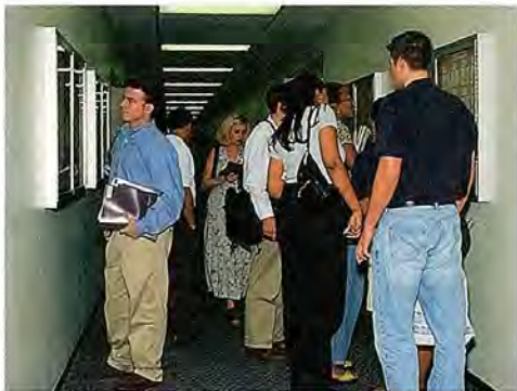
The second part of the day was dedicated to the logistics of registration like checking out class schedules and wading through paperwork for photo IDs and parking.

T he new 15-acre campus is three times the size of the Hancock Park site, with plenty of room for growth. Space alone has increased from 55,000 square feet at the old site to 130,000 square feet in Costa Mesa. There are four rusty-orange, single-story buildings with 14 computer-networked lecture halls and two Moot Courts—all with double-walls and special paneling, rendering them impervious to outside