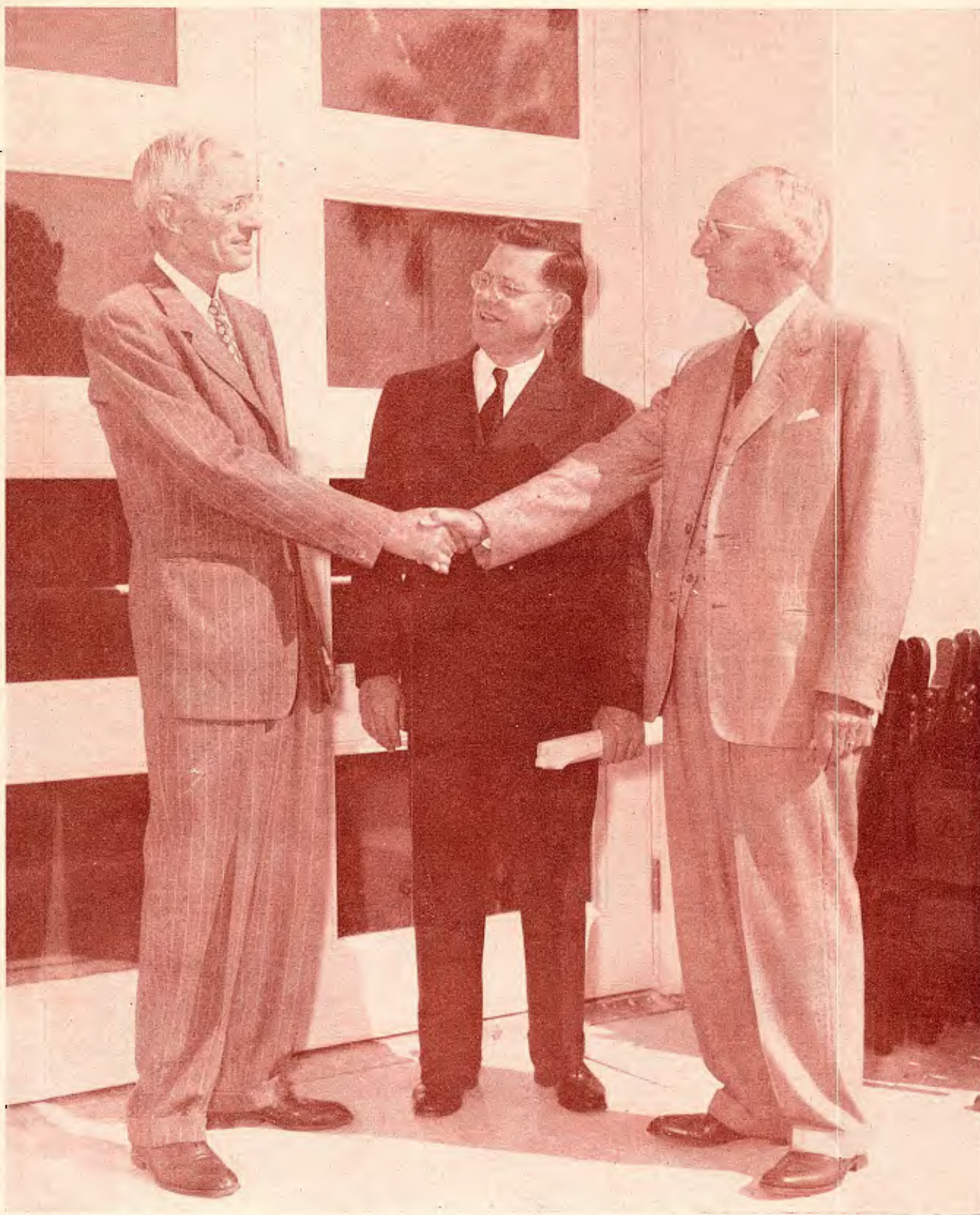
ANOTHER STEP IN POET HISTORY— LOU. HENRY HOOVER MEMORIAL HALL DEDICATION